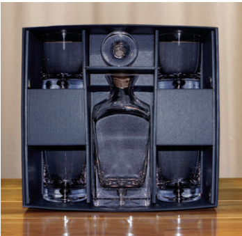
DECANTER SET GIFT BOX