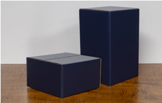
STANDARD GIFT BOXES

All merchandise is attractively packaged in protective boxes suitable for presentation as listed: